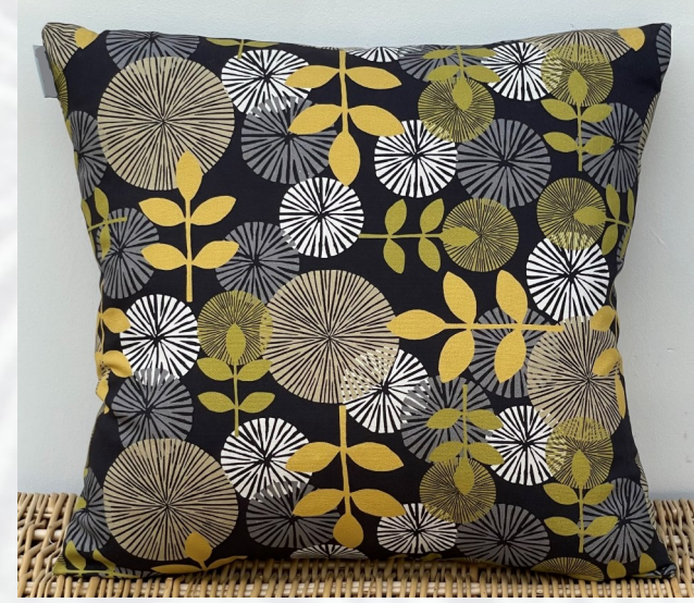
Cushion Covers-Double Sided