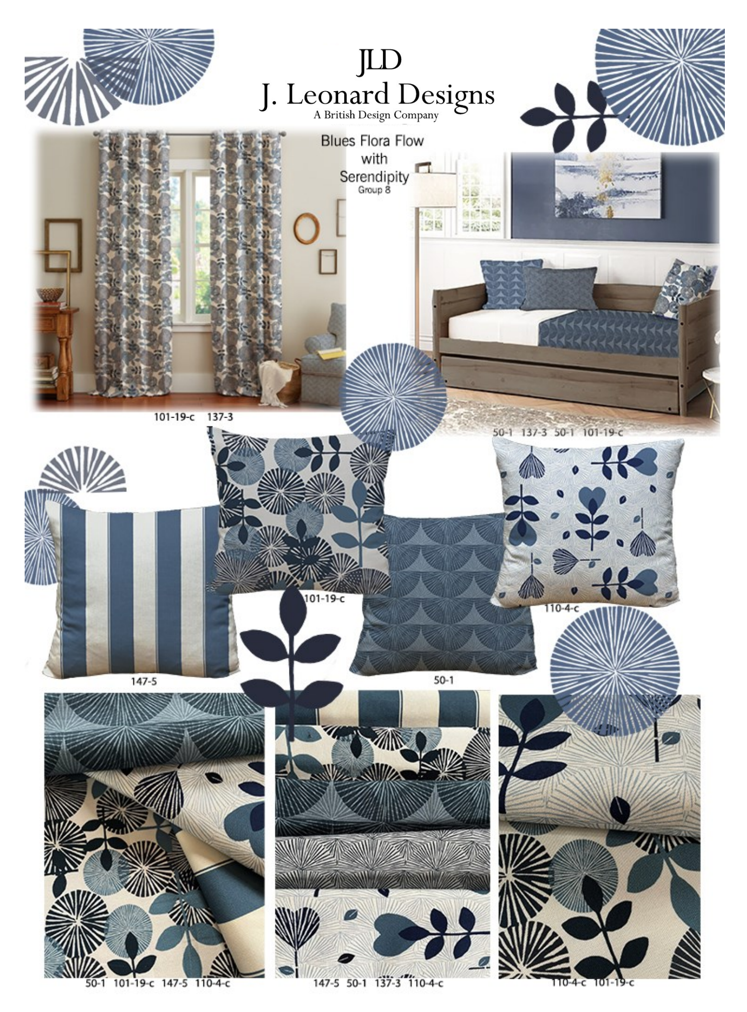
Beautifully blue. Layering of blue tones and prints, with clean classic lines. Our blues collection is a versatile and modern addition to any room.