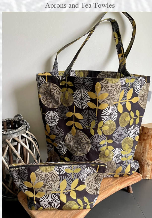
Tote Bags and Cosmetic Bags