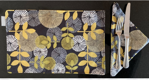
Place Mats and Napkins