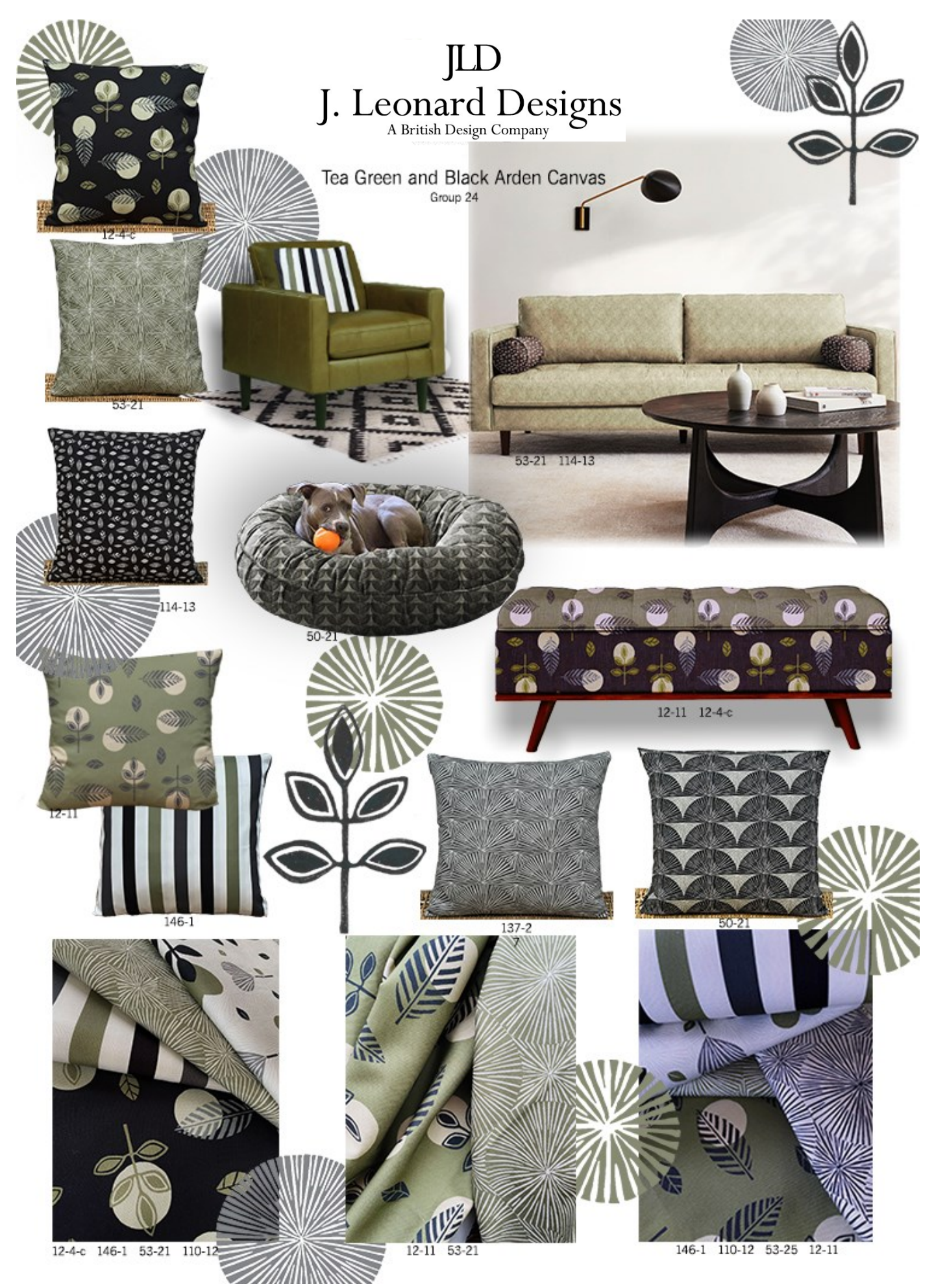
Modern organic, earthy green, dark backgrounds with grey and stone accents. A contemporary feel with a bohemian vibe.